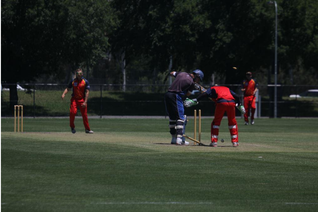
Different Barrington but can't ignore a stump flying out of the ground!!! The skip with 2/29 off 10

Panda was also economical and accurate through the middle overs and along with Dan at the death kept ANU to a below par score. Matty rog produced another tidy 10 overs taking 2 wickets along the way. Fielding was excellent, first game where we haven't spilled a chance and there were some difficult catches taken - a big positive!